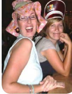
Thinking caps on!